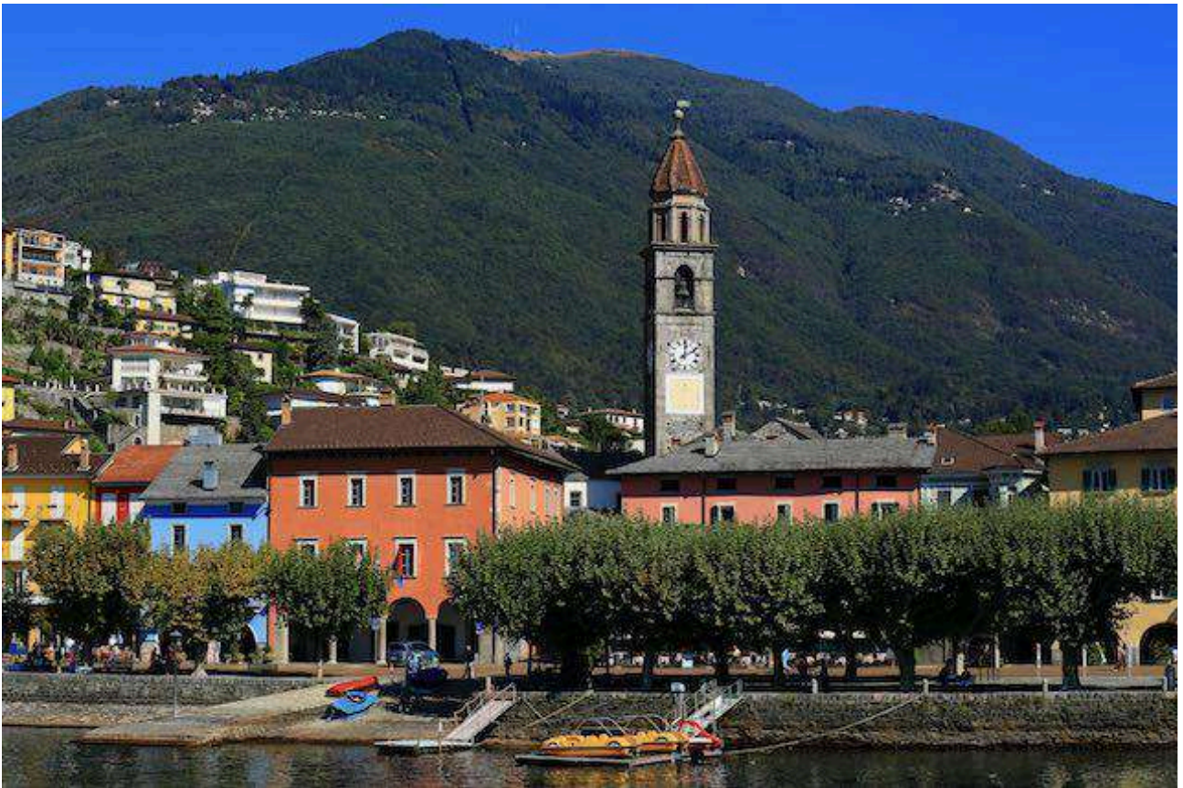
Ascona: "SWISS VILLAGE OF THE YEAR 2025"